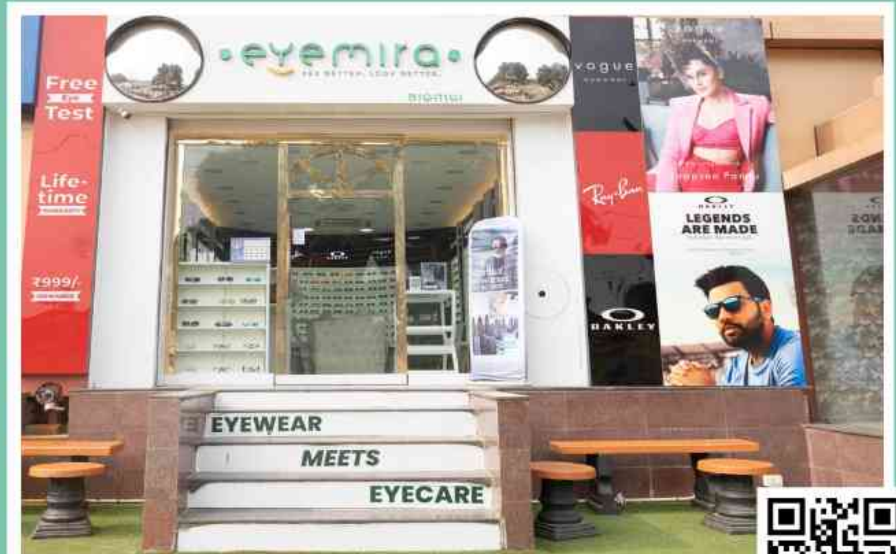
2 Eyemira - Ground Floor, Infocity Food Mall, Near CTTC, Patia - Bhubaneswar