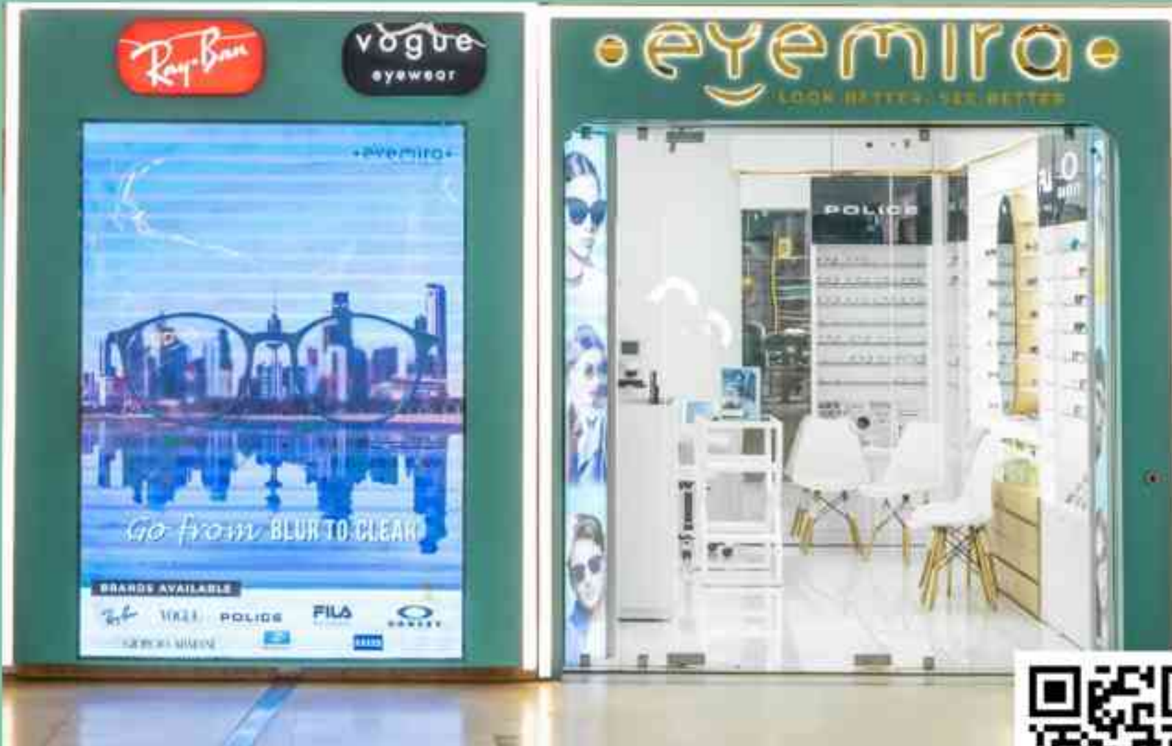
1 Eyemira - Ground Floor, DN Regalia Mall Patrapada - Bhubaneswar

CURRENTLY WE ARE HAVING 2 STORES IN BHUBANESWAR